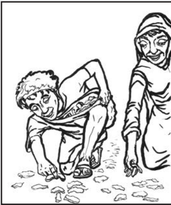
God gives the Israelites the miracle of manna.

When God asks Moses to lead the Israelites out of Egypt, it is clear that God's people need to learn who God is again. God wants the Israelites to worship Him. He promises them a wonderful future. The Sabbath is an important learning experience for God's people. The Sabbath helps them to discover what they have forgotten. The Sabbath also shows other countries around Israel that Israel has a special connection with God. The experience of the manna shows God's way of educating the Israelites.