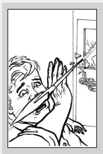
Edu raised his arm and blocked the spear. The top of the spear cut off the tip of his nose.