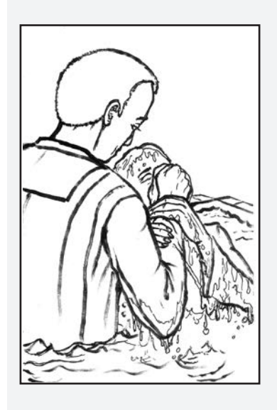
Small groups can make big changes happen!

ADDITIONAL THOUGHT: Many years ago, a small church in Europe decided that it had to do something big and important for God. The church was not growing. No one had been baptized in the church in a long time. The church did not have a bright future. The pastor and the church leaders prayed. They thought about a plan to help the church.