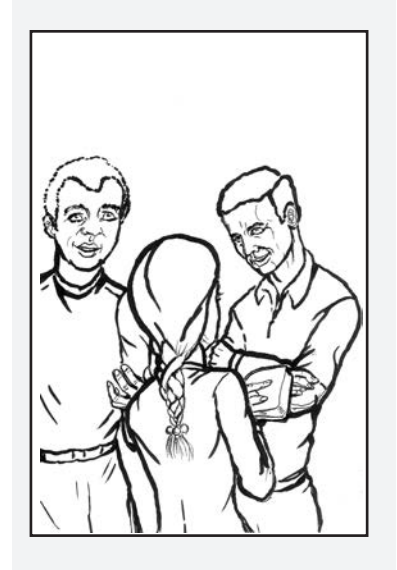
Small groups give us the chance for warm, caring friendship, spiritual growth, and problem solving.

Think about a time when you were part of a small group that cared about each other. What did you learn from that experience that can help you understand why small groups should be an important part of our faith?