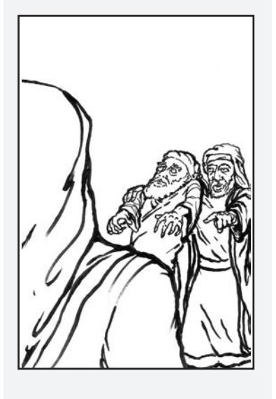
Many people will never come to Jesus on their own. They need someone who has faith to bring them.

What else can we learn from this story? How does it show us that sinners may need both spiritual and medical help?