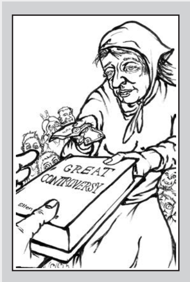
The book was too expensive for the woman's budget. But she knew she must buy, read, and share this special book.