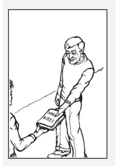
Pray that God will send us out to collect His "crops" of people.