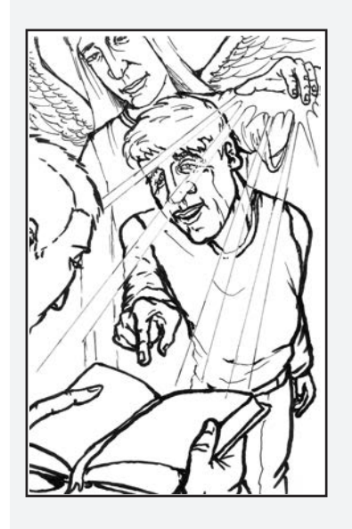
We need to have spiritual hearts to listen and spiritual eyes to understand. Then God will send His angels to help us touch people's hearts.

Do you see how important the Bible is in Philip's story? Also, do you see that it is important for someone who knows Bible truth to share his knowledge with the one who wants to know more? What does that teach us?