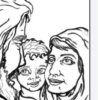
Jesus sees all men and women as souls He can win for His kingdom.

MEMORY VERSE: "Jesus said to them, 'Come, follow me, and I will make you a different kind [sort; type] of fishermen. You will bring in people, not fish' " (Matthew 4:19, ERV).