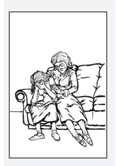
The secret to winning people to Jesus is showing them that you care. You do that by building strong friendships.

Why is it often so hard to lead family members to Jesus? What has been your own experience? What important rules about sharing Jesus with family members can you share with the class?