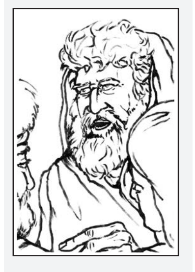
"The power to fight against evil comes from working hard to serve God."

5 God loves each one of us as if we were the only person on earth. This fact is wonderful! What does this Bible truth mean to you? It is the most important truth on earth and in heaven. How should you live your life because of it?