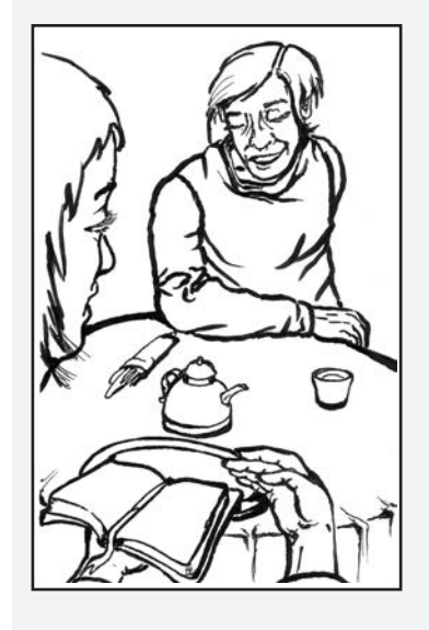
Share with people what Jesus does for you. Then your spiritual life will grow strong.

Have you shared Jesus with anyone? How did your experience make your faith grow stronger?