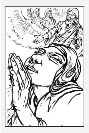
All heaven feels joy and sings when God saves a sinner.