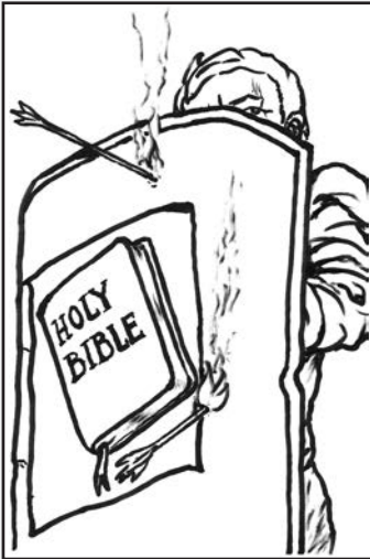
The Bible is our spiritual shield.

The Holy Spirit led humans to write God’s Word, the Bible. So, we can trust the Bible as a guide for our lives. The Holy Spirit will never lead us to believe anything that goes against God’s Word. The Spirit also will never lead us away from God’s Word. For Seventh-day Adventists, the Bible has more power than human tradition, or the way things have been done for a long time. For us, the Bible also has more power than experience, reason, and culture, or the ways of life around us. Only the Bible is the test for everything in life. It helps us decide what is good and right.