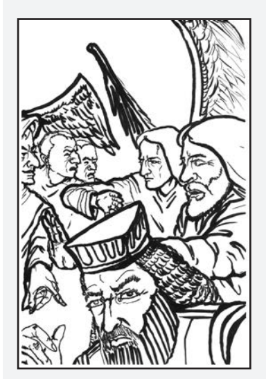
Jesus and Gabriel stop the evil powers at work on King Cyrus's heart.