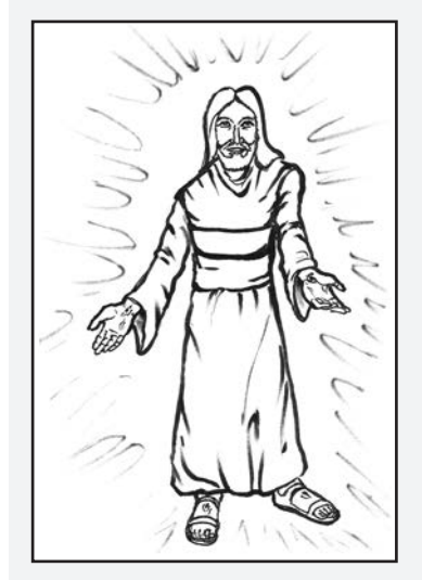
The Person Daniel sees in Daniel 10:5, 6 wears gold the same as a king. He is as bright as lightning, fire, and brass. He is a priest, a king, and an army leader.

Read Joshua 5:13–15 and Revelation 1:12–18. How is the picture of the Son of God in Joshua and in Revelation the same as the picture of God in Daniel 10?