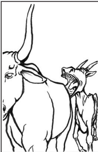
In the 1st dream, seven skinny cows eat up seven fat cows.

God uses this same plan in the book of Daniel too. Daniel shows us four prophecies, or time messages. God gives us the same message in each prophecy. Each prophecy is a little different. But all four prophecies show us the same time in history. We can see this pattern in the chart below.