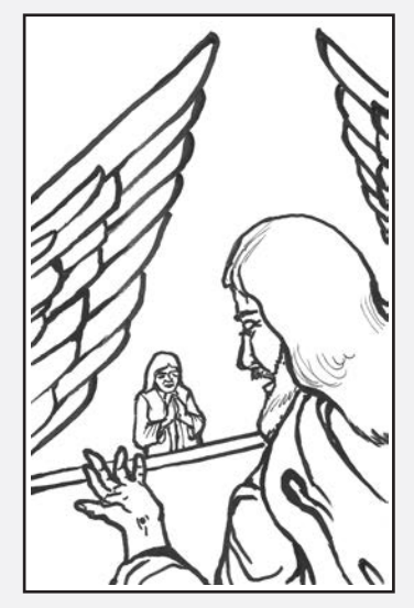
"By faith, we must join [Jesus] in heaven."

What is the work of the Levites a word picture for? For the answer, read Hebrews 9:1–11.