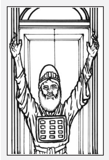
The people "gave the temple to God to honor him" (Ezra 6:16, ICB).

This week, we will look at how the Jews worshiped God in Nehemiah's time. What can we learn from their worship?