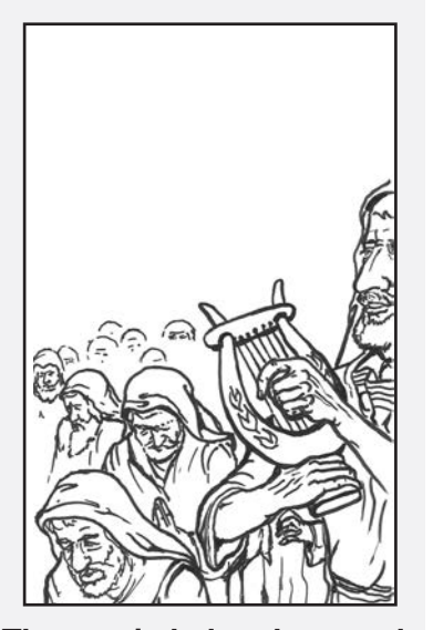
The music helps the people honor God in the temple.

Both on earth and in heaven, music is an important part of worship. In the verses above, the people sing about everything God does for them. That is why they praise Him.