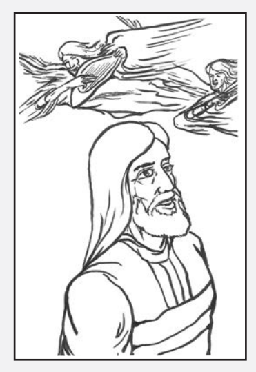
"The angels love to praise [Jesus]."

The Jews finish building their city wall. Then they give the wall to God. They ask Him to protect their wall. They understand that no wall by itself can keep them safe. So, God must protect their wall. Solomon says: "If it is not the LORD who builds a house, the builders are wasting their time. If it is not the LORD who watches over the city, the guards are wasting their time" (Psalm 127:1, ERV). What does Solomon's wisdom here show us we should do first before we start any work for the Lord?