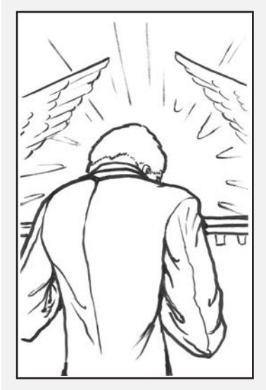
"God's true servants always go to God's throne for help."

The study of Bible history shows us the danger we will be in when we give up our beliefs. People often stop doing what they know is right so that they can get riches, power, or fame. Sadly, the whole history of Israel shows us this is true. What Bible truths can we follow to help us not make Israel's same mistakes? What will help us stay true to our beliefs?