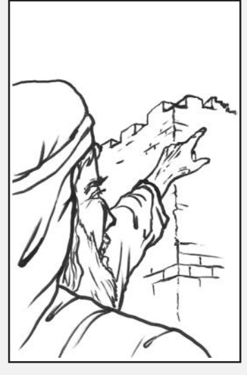
Nehemiah feels that the work he does for God is more important than anything else he can do.

During the time that Nehemiah works for God, a man named Shemaiah wants to meet with Nehemiah. Shemaiah tells Nehemiah to meet him inside God's temple. The inside of God's temple is very holy. Only priests, or holy leaders, can go there. So, Shemaiah shows he is a false prophet, or messenger. God never sends a messenger to tell His people to do something that He said they should not do. Shemaiah's words show us that his heart is evil.