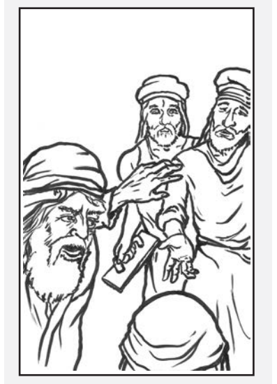
When the people from Samaria offer to help, the Jews say, "No, thanks."

What else in Ezra 4:4, 5 shows us why God's people do the right thing?