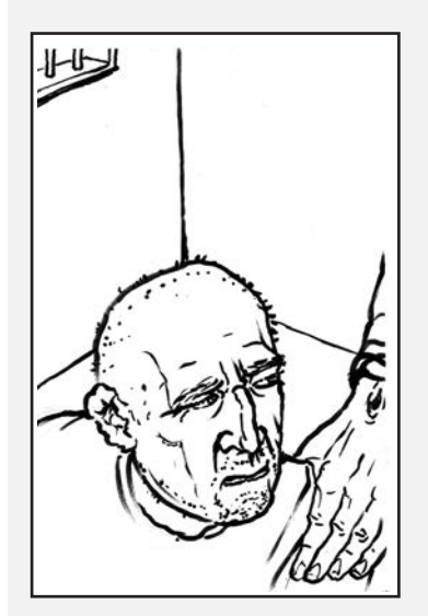
God's love and mercy can reach down into the deep darkness and save us.