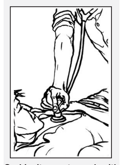
God invites us to work with Him to stop sickness, hunger, and evil on this earth.

How does serving other people bring us closer to God? What has been your experience?