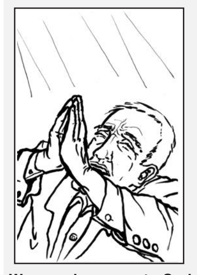
We can always cry to God for help.

At different times in life, we may be hurt by people in power. Other times, we may not be fair to other people. Psalm 82 helps us to find help and wisdom in both experiences. God cares about bad judges. God says they are His children too. He wants them to choose a better life. So, there is hope for us all if we allow God to change us.