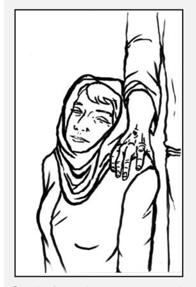
God gives hope to people who feel hopeless.

We cannot study everything in this lesson that Psalms and Proverbs say about showing mercy and being fair. But we hope that this lesson will cause us to do more to help the poor and the needy around us. It is our job to help them.