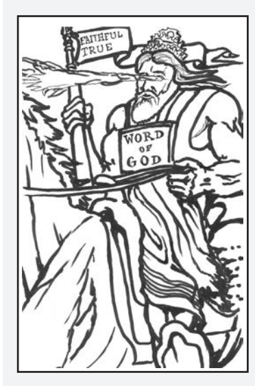
The kings from the east in Revelation 16:12 are Jesus and His army of angels.

What work is that? Satan gives his evil team power to do miracles the same as Jesus did when He lived on earth. You will remember that Satan's evil team includes: (1) the dragon (false religions and the belief that dead people communicate with the living); (2) the wild sea animal (the Roman Catholic Church); and (3) the false messenger (Protestant churches that turned away from Bible truth). The miracles that these three powers do are part of Satan's end-time plan to trick the people on earth so that they will join him in the war against God's people. Yes, the leaders on the earth feel tricked and fooled. But they join Satan anyway. When that happens, everything is ready for the big war that will cause the end of this earth's history. The name of this big war is the battle of Armageddon.