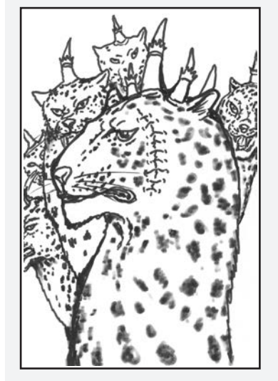
The healed cut shows us that the wild sea-animal power gets back the power it had during the Middle Ages.

When the church turned away from Bible truth, she became rotten. She lost the Spirit and God's power. Then the church used the government to control people's minds, to make herself powerful, and to punish anyone who disagreed with her teachings. . . . When the churches in America join together to cause the government to support their laws, Protestant America will become an exact copy of the Roman Catholic Church. Then the Protestant churches will punish anyone who does not obey their laws. . . . The 'god that looks like [the same as] the first wild animal' is a word picture for what will happen when Protestant churches in America use their government to punish anyone who does not support their teachings."—Ellen G. White, The Great Controversy , pages 442–445, adapted.