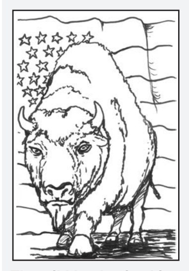
The wild land animal is a word picture for only one end-time power on the earth: the United States of America.

Revelation 13:11 shows us that soon the wild land-animal power that looks the same as a lamb will start to talk as a dragon. The wild land-animal power will try to make everyone on earth worship the wild sea-animal power. That shows us that the country that offered a safe place to God's church will attack God's people at the end time.