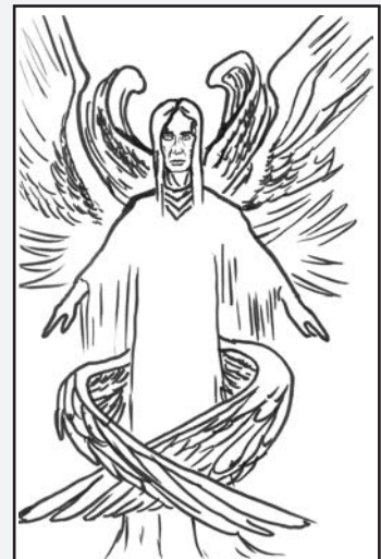
The four living things are holy and powerful. They serve God and guard His throne (Psalm 99:1).

The four living things are holy and powerful. They serve God and guard His throne (Psalm 99:1). Their six wings show how fast they act to do whatever God asks. Their many eyes show how smart they are. One living thing looks the same as a lion. The 2nd living thing looks the same as a cow, the 3rd the same as a man, and the 4th as an eagle. Together, the four living things, the many angels around God's throne in the temple, and the 24 elders show us that people from heaven and earth are in God's throne room.