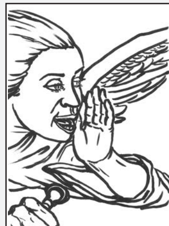
The second angel's message announces the fall of Babylon.

Should we be surprised that God will judge Babylon? Of course not. Babylon in the Old Testament was judged (Daniel 5). The Bible makes it very clear in many verses that everyone will have to stand in front of God to be judged. That includes Babylon. How comforting to know we have Jesus to stand for us on the day we are judged (1 John 2:1).