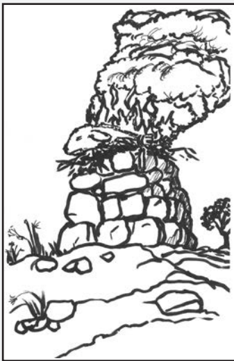
Jesus was the Lamb of God who takes away our sins.

The book of Hebrews talks about the work Jesus does as our High Priest (Hebrews 1:3). A high priest is someone who works to save his people. As our High Priest, Jesus works to save us. Jesus became our High Priest after He took our place on the cross and died for our sins. Jesus was the Lamb that God offered on the cross for our sins. Then Jesus woke up from the dead. He went to heaven and entered the sanctuary. The sanctuary is the place in heaven where God is worshiped and where His throne is. There, Jesus now works to save us and get us ready to live with Him in heaven. Hebrews 7:1–28 talks more about Jesus’ work for us in the sanctuary and the things He is doing for us.