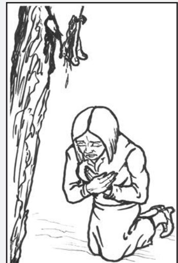
Jesus’ death on the cross for us should help us not to be proud.

What does the Cross teach us about why we should not be proud? Where would we be with no Cross? Why is the Cross the only thing we can brag about? (Read Galatians 6:14.)