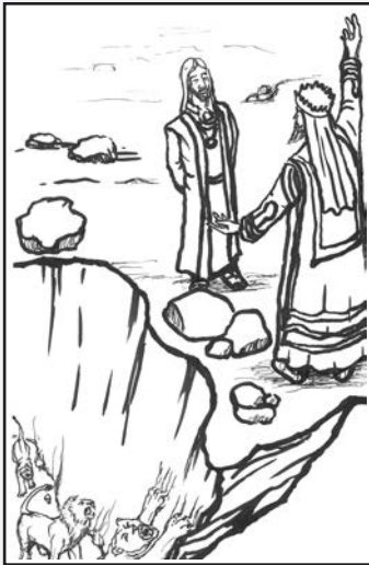
King Darius’s words show that he knew Daniel’s God was powerful.

Make a picture in your mind of the story in Daniel 6:4, 5. Pretend you are Daniel. What reasons could you, as Daniel, give for not praying? After all, praying would get Daniel thrown into the lions’ den. So, why could Daniel have said it was better not to pray?