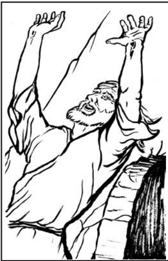
Jesus broke the chains of death.

What has been your own experience with how awful death is? Why must we have hope in something more than ourselves or anything this life offers?