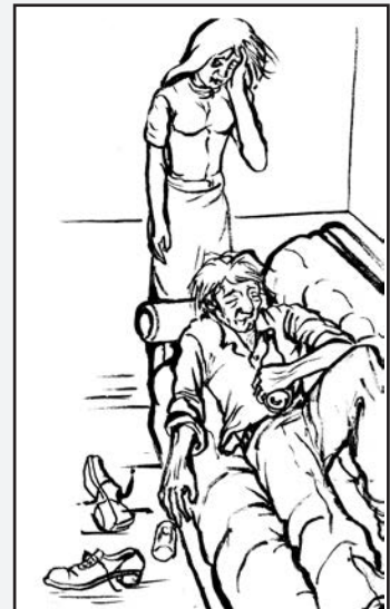
Look at what sin has done to damage the things God made on this earth. How could God not be angry at all the evil and ruin?

Paul seems to be putting importance on the fact that Jesus rose from the dead. Jesus is alive forever (Hebrews 7:25). But what would happen to us if Jesus stayed in the grave? Then our hopes would have died with Jesus. But Jesus lives. So, we are saved. That is the reason for our joy.