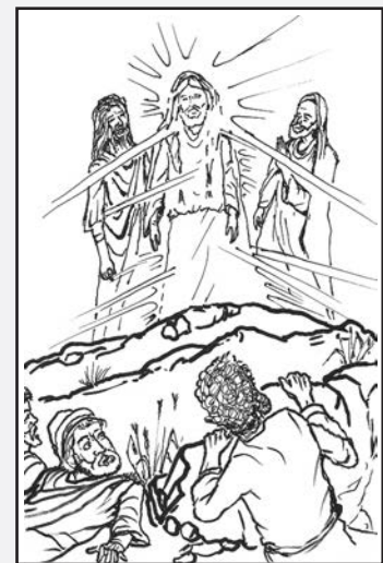
The Transfiguration stands out for Peter. It shows Jesus is the Son of God.

Think of an event that has had a deep effect on your spiritual life and faith. What event was it? How did it affect you? And what does it mean to you today? Why do you think it had the power that it did?