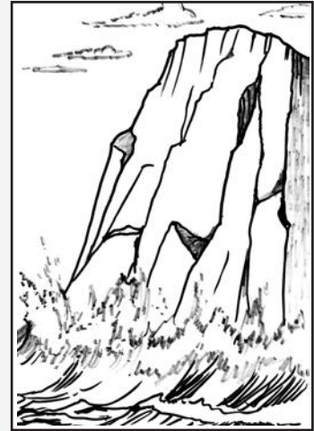
Jesus is the Rock of our salvation.

Read Colossians 3:12–14. In these verses, how should a Christian treat others? How can acting this way help there to be oneness in the church? Why is treating others this way so important to there being oneness in the church?