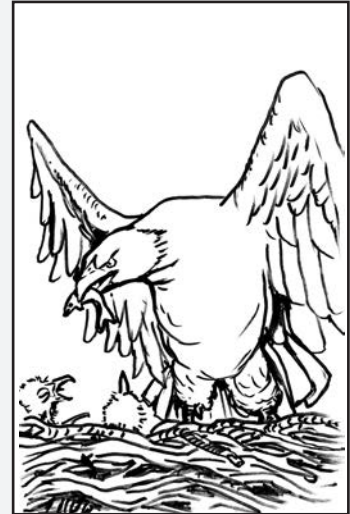
The Bible compares God to an eagle hovering over its nest of young.

The Holy Spirit was not only there at the creation of this world, but He also has an important part in the process of our re-creation (being made new). His part is giving us a new heart and a new mind. How are both of these jobs of creation and re-creation related? How does the Sabbath help us to understand and appreciate more fully this work of creation and re-creation?