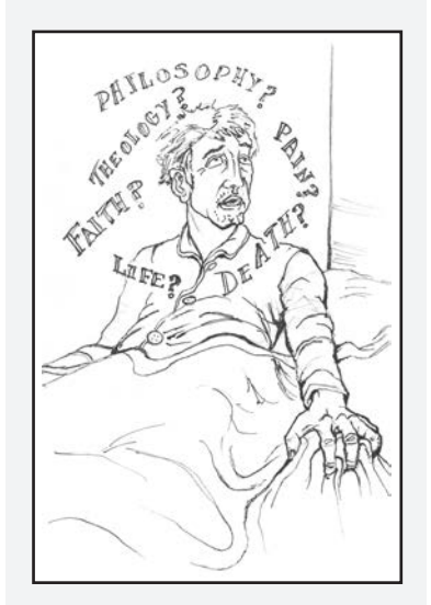
There is nothing like a terrible event to shake us out of our spiritual "sleep" and to start us asking the important questions.

How have you been able to think back on past suffering and find the good that has come out of it? How do you deal with those troubles that have brought nothing good?