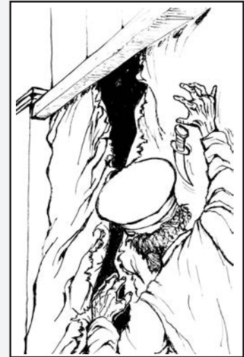
After Christ died, the curtain in the temple was torn from top to bottom.

Matthew writes about the tearing of the veil, the rocks splitting, the graves opening, and some of the dead being raised. These events can happen only because of what Jesus does by dying as our Substitute for sin. So here in Matthew, we can see things happening that the old system itself could never have done. “It isn’t [is not] possible for the blood of bulls and goats to take away sins” (Hebrews 10:4, NIV). Of course, only Jesus can take away sins. And for us the great promise that Jesus will remove our sins can be fulfilled through the resurrection from death. Without that promise, we have nothing (read 1 Corinthians 15:13, 14, 19). In these early resurrections (we do not know how many), we can see the hope and promise of our resurrection at the end of this age.