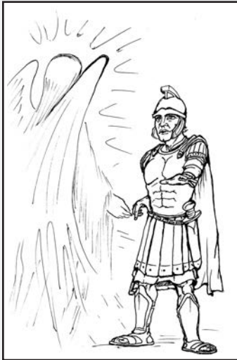
God heard Cornelius's prayers and sent an angel to him.

Even though Cornelius did not fully understand truth, what are some of the traits of Cornelius that we all would do well to follow in our own spiritual lives?