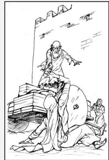
Jonah preached God's message of doom and mercy to Nineveh.

God has given us some wonderful promises, and serious warnings too. What should this story teach us about the seriousness of these promises and warnings?