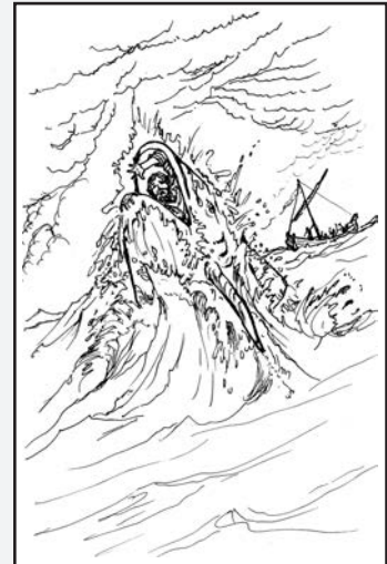
The crew threw Jonah overboard, and a great fish swallowed him.

In the end, there is only one God, the Creator of the heavens and the earth (read Isaiah 44:8; Isaiah 45:5, 6). Anything else anyone worships is idol worship and error. If we are mission-minded, why is this truth so important for us to understand and study for ourselves?