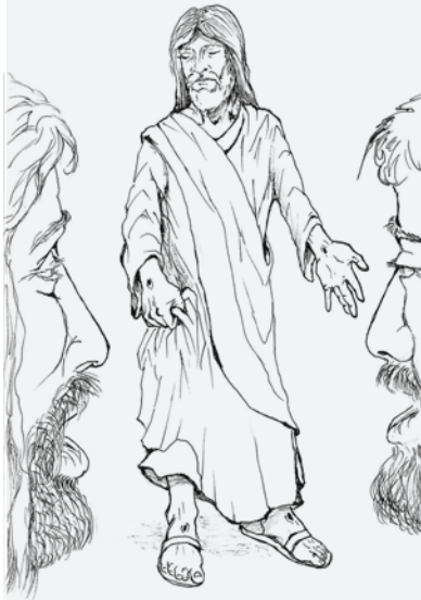
Jesus showed them His hands and feet.