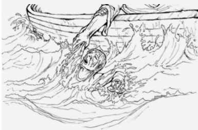
As rescued sinners, we can tell others what Jesus has done for us.

Jesus' first meeting with the disciples after His return to life was very important. They were afraid, discouraged, and puzzled. They had locked the doors of the room out of fear. But Jesus came and stood among them. With a clear and warm voice, He said to them, "Peace to you." Surprised and terrified, they could not believe their eyes and ears. Lovingly, the Lord showed them His hands and His feet and explained to them everything the Bible said about Him. That night, Jesus' appearance and words changed them greatly. He removed their anxiety and unbelief and filled them with the peace and joy that come from the proof of His return to life.