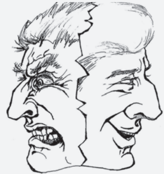
Many of the scribes and Pharisees led two-faced lives.

Read Romans 10:3. How does this verse help us to understand what true righteousness really means?