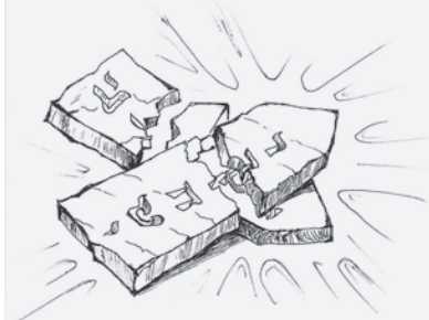
The Pharisees were so focused on man-made laws that they broke God’s law.