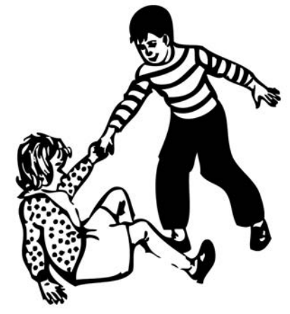
Service to others makes us strong in the faith.

What things in life challenge your confidence (faith) in God or your full belief in His good will for you? What can you do to help to protect yourself from this spiritual danger?