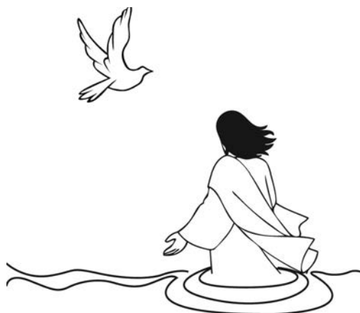
Jesus was anointed with the Holy Spirit.

Read Philippians 2:5–8. What parts of a life filled with the Holy Spirit show up in this special description of Jesus?