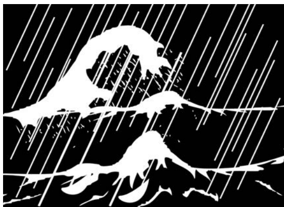
Zephaniah compares the coming judgment to the Genesis Flood.

Read Zephaniah 1:18. In what ways do we even now experience the truth of the principle (important rule) shown here? For example, what kinds of situations have we faced where all the money in the world could not save us?