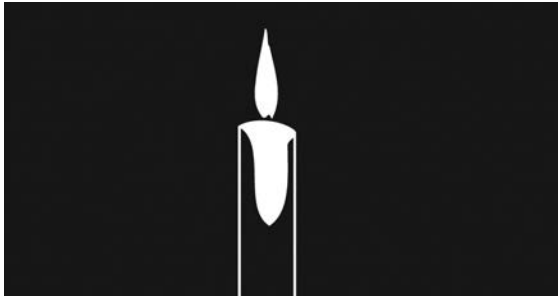
The darkest spot in the room is right under the candle.

that the darkest spot in the room is right under the candle. This saying could be used to explain the sinful condition of Jerusalem in Zephaniah's time. The prophet has just finished announcing God's judgments on Judah's neighboring countries (read Zephaniah 2). These countries are Philistia in the west, Moab and Ammon in the east, Cush in the south, and Assyria in the east. But Zephaniah does not stop there. Then he exposes the sins of those who live in God's own city on earth, Jerusalem itself.