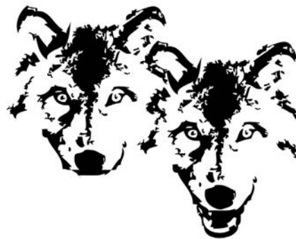
The dishonest judges are described as evening wolves.

Look around. The world may be attractive, but in the end it is going to be destroyed. A person does not even need to believe in the Bible to see how easily this could happen. Why is the Lord our only hope? How can we learn to depend on Him more and more and not trust in the empty things of this world?