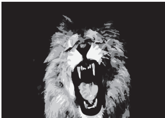
Satan roams about like a lion trying to destroy us.

over the principalities and powers, why are we still struggling with principalities and powers? And why is the devil still able to roam about like a lion trying to destroy us?