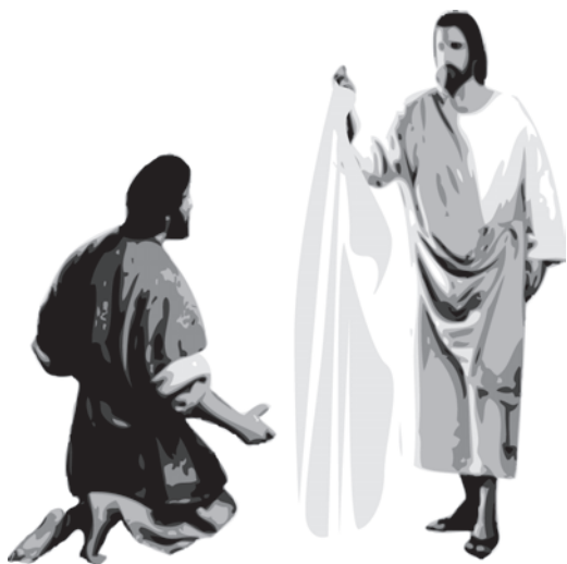
Christ gives us His perfect life in place of our own “filthy rags.”

Where would you be if you could not hold on to the promise of mercy during every minute of your life? What if your acceptance with God was not based on what Jesus has done for you but on yourself or your own works and law-keeping?