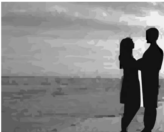
Eve is created out of Adam to show how close a husband and wife are meant to be.

A lot has been written over many hundreds of years about the meaning of these verses. What is fascinating here is the closeness between Adam and Eve. Adam is created out of the ground and Eve out of Adam (something that helps to separate her from every other earthly living thing). To be made in God's image certainly means close and loving relationships (something that surely shows the relationship in the Godhead itself).