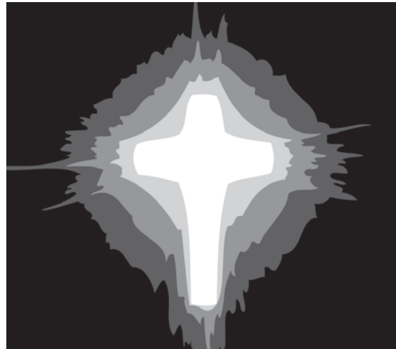
Jesus is the hope for our renewal.

The Bible tells us that we need to be always watchful in the spiritual war with Satan. It is the war between the flesh and the spirit (Galatians 5:16, 17). Those who are being renewed in God's image find this spiritual war very real in the human experience. So they accept the challenge in the strength of the Lord (Ephesians 6:10–13). If we, too, choose to be remade in the image of God, then we place ourselves on the side of God in the great controversy. Ellen G. White writes about those who have experienced the renewing power of Christ. She says, "Because this experience is his, the Christian must not sit back and be comfortable with what has been done for him. He who has determined to enter the spiritual kingdom will feel all the attacks of Satan against his sinful nature [who someone is]. Each day he must renew his dedication to God. Each day he must do battle with evil. His old habits will try to control him. Against these he is to be always on guard. He needs to work hard in Christ's strength for victory."—Adapted from The Acts of the Apostles [Teachers and Leaders] , pages 476, 477.