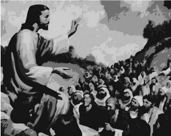
The crowds of people filled Jesus with compassion (mercy).