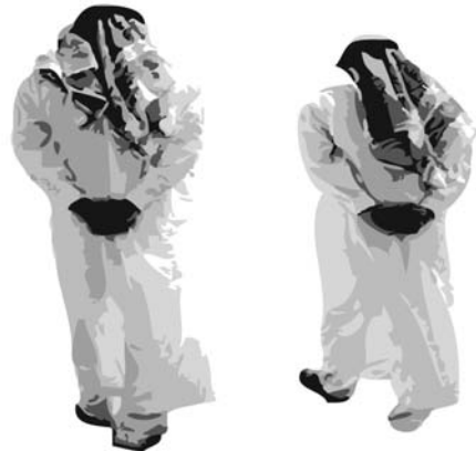
Philip invited Nathanael to come and see Jesus.

In the circle of people around you, to whom could you be a better witness? How much sacrifice 3 will you make to be a better witness to them?