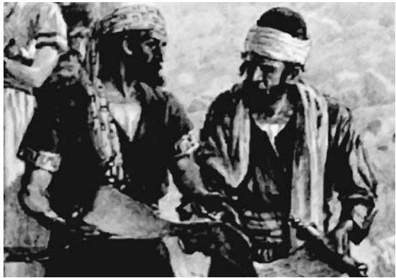
Philip witnessed to the Ethiopian treasurer (Acts 8).

about how the disciples were led by the Holy Spirit?