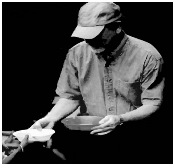
The deacons helped the widows so that the disciples could be free to preach.

What important lessons can we learn from this?