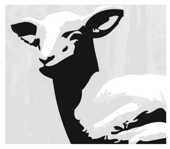
Holy fire appeared to show that God had accepted the sacrifice.