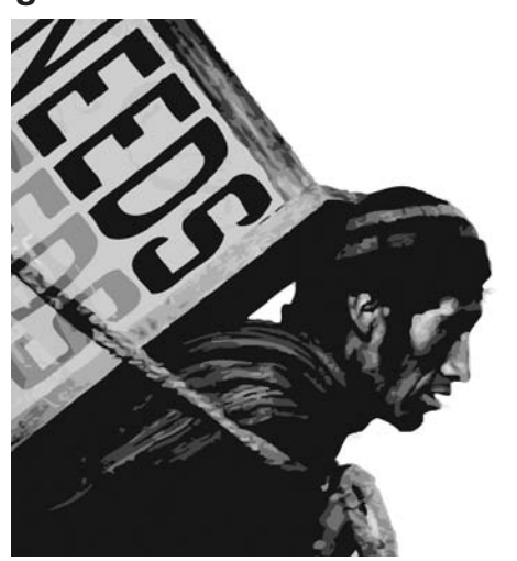
We should always come to God with our needs.

What are the broken places inside you? How can you learn to give them to the Lord?