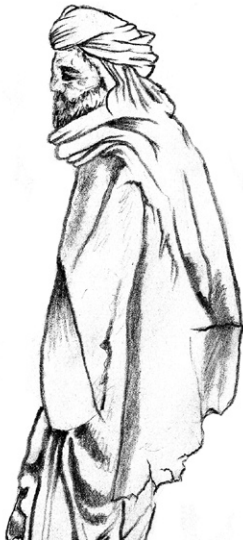
Ahab tore his robe, a symbol of true sorrow for his sin, and put on sackcloth.

“Godly sadness causes us to turn away from our sins and be saved. And we are certainly not sorry about that! But worldly sadness brings death” (2 Corinthians 7:10, NIV). What does this verse mean? And how can we use this warning in our own lives?