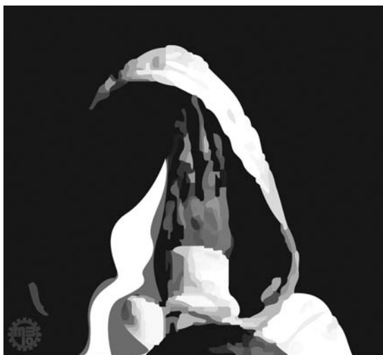
The still, small voice of God caused Elijah to wrap his face in his mantle.

saw a great wind, an earthquake, and a fire. But none of these things caused Elijah to wrap his face in his mantle. It was only the presence of the Lord in “a still, small voice” that caused him to do this. This shows Elijah's fear, respect, and self-protection.