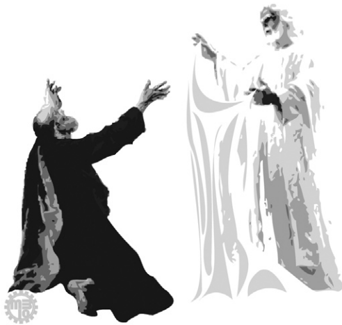
Elijah put his mantle, a symbol of his responsibilities, on Elisha's shoulders.

Think about how a single object (thing) can have both good and bad sides to it. It depends on how it is used. What are you doing with the things in your own life? What kind of meanings are you, by your actions, giving them? What have they come to symbolize (to stand for) to you, and why?