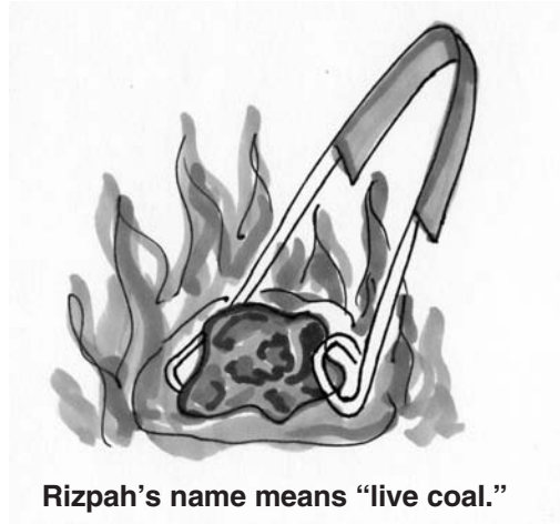
Rizpah's name means "live coal."

of Saul at this time. With the help of Abner, Ishbosheth has been made king of Israel and has moved across the Jordan to Mahanaim (2 Samuel 2:8–10). The writer of this story includes information about Rizpah's father ("daughter of Aiah"). This tells us that her family must have been important and that she was not a slave. The name of Ishbosheth appears in another form in the family history of Saul, as Eshbaal, "the man of Baal" (1 Chronicles 8:33). The form used in 2 Samuel 2:8–10 seems to be an insult by the Bible writer: the man of Baal is an embarrassment to the house of Saul. This is how a "man of shame" appears.