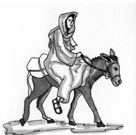
Abigail does not just send gifts off to David; she saddles her donkey and rides out to meet him.

not just send the gifts off and then wait to see what happens. She rides out to meet David herself. Abigail is married to a cruel and stubborn man. But she has not allowed him to crush her spirit. She still has a strong sense of self-worth. She is ready to risk her life in order to protect her household. This is something like the young David facing Goliath. 6 This time it is a woman with donkeys loaded with food and a few servants, going to face 400 armed and angry men.