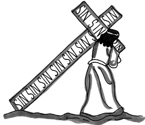
The sinner must put his sins on the Sin Bearer.

Paul explains that salvation by faith was not only for the Jews but for the Gentiles (non-Jews) too (Romans 4:9–12). For example, Abraham was not Jewish. Abraham came from a pagan 10 background (Joshua 24:2). The Gentile-Jewish difference was