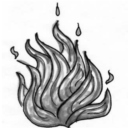
The Holy Spirit sears the heart with the knowledge of what it is doing wrong.

No question, the more we continue in evil and do what is wrong, the more astray we go from the Truth. Again, you can have more than enough knowledge to be saved. But, sadly,