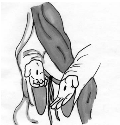
The Truth is a Person.

At the same time, there is a whole other part too. The Truth is a Person. You come to truth through a relationship 1 with a Person. This is very different from the idea of truth being only a group of facts. Jesus, a human being, is the Truth. So, if you want to know truth, you have to know Jesus.