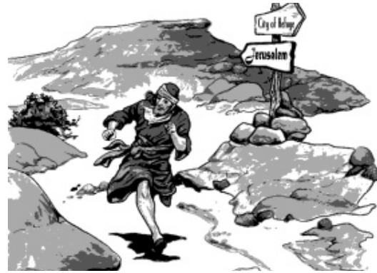
The runaway dared not for one moment slow down until he was safe inside the walls of the city.

Do you feel that you are not good enough to be saved? Do you feel that your sins are too great for you to be accepted by God? Do you feel that you are unworthy of forgiveness? If so, then why is it important to forget about how you feel and claim the promises of forgiveness, salvation, 17 and acceptance offered to you by Jesus?