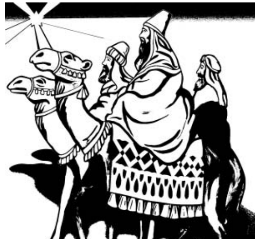
“There shall come a Star out of Jacob.”

Bible students long have believed these words to be a prophecy of the coming of the Messiah, the Savior, Jesus Christ. The scepter (power) and the star (light) both are perfect symbols 16 of Jesus. At the time of the prophecy itself, the Lord used local symbols. These symbols would have meaning to those who heard it then. But the promise behind the prophecy (Christ’s power and victory 17 ) is given to the whole world. Jesus is the Light of the world. He is the rightful Owner of it. In the end, the whole world will see Him come in triumph. Read Isaiah 45:23; Romans 14:11; and Philipians 2:10.