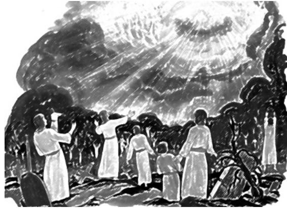
God showed Balaam the future.

“Balaam saw the people of Israel. They were supported by God’s arm as they entered the dark valley of the shadow of death. And Balaam saw them coming forth from their graves; they were crowned with glory, 10 honor, and eternal life. 11 He saw saved people living happy lives on the earth made new. Watching the scene, Balaam spoke, ‘Who can count the dust of Jacob, and the number of the fourth part of Israel?’ He saw the crown of glory on every forehead. He saw the joy beaming from every face. He looked into the future to that endless, happy life. Balaam then spoke the prayer, ‘Let me die the death of the righteous. Let my last end be the same as these peoples!’ ”—Adapted from Ellen G. White, Patriarchs and Prophets , page 447.