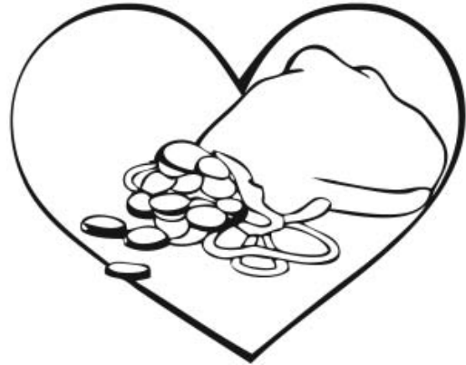
The Lord knew what was in Balaam’s heart.

A lot has been written over a long period of time about this story. It is one of the stranger stories in the Bible. Different Bible experts come away with different meanings. But one point seems clear: Balaam was a man who had a special connection with the