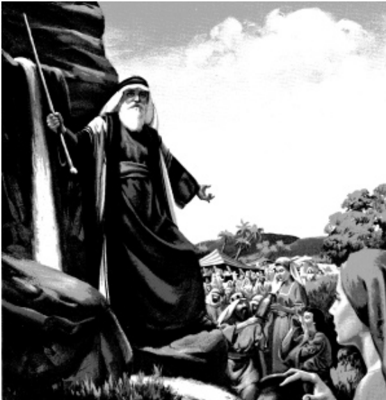
Moses struck the rock.

Think of a time that you felt pushed too far and did something terrible and sinful. How often did you wish you could have turned back the clock and undone the damage? What lessons have you learned from this experience that could help you to not do the same thing again?