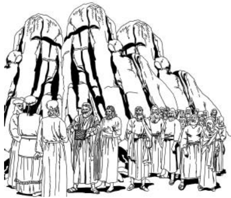
Aaron's work as high priest passed on to his son, Eleazar.

If you were to die tomorrow, what legacy 9 would you leave behind? What have you done for the Lord's work? How can you better use the little time that you have left (James 4:13–15)?