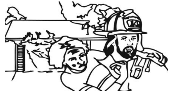
God wants us to know that He saves us.

But, how, according to Matthew 10:22; 1 Corinthians 9:27; and Revelation 3:11, can we be pro-