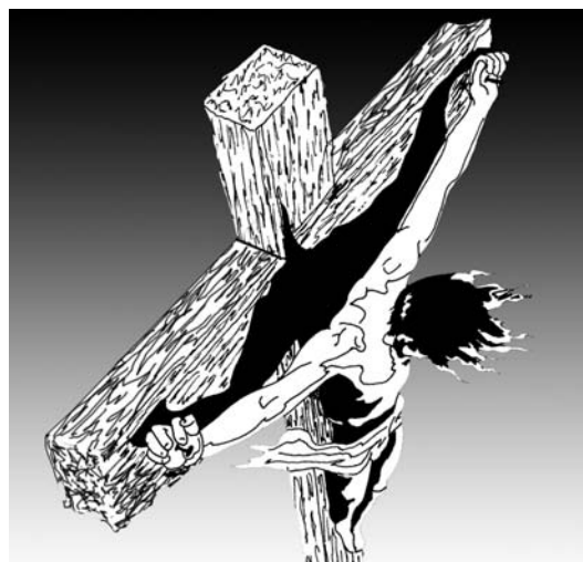
The blood of Jesus frees us from sin.

The antichrists of 1 John may not have understood fully the true value of the Cross and why Jesus died there in our place. How foolish because Jesus paid the penalty (price) for all our sins and died in our place! This fact forms the foundation of God's plan for saving us from sin. Christ's death was the only way possible for humans (men, women, and children) to be saved and have the promise of eternal (forever; without end) life. To miss that is to miss the purpose of the entire gospel (good news about Jesus).