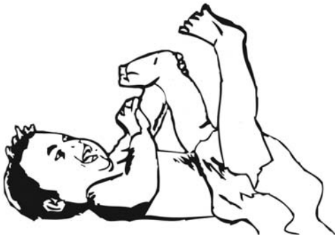
The new birth is God's work, not ours.

First John 3:1 points to a spiritual birth. John 1:12 calls our attention to the faith in Christ by which we become children of God. First John 3:1 teaches that believers are already God's children. God has taken the first step to do this for us. The new birth is His work, not ours. We cannot boast about our own birth or our adoption as God's children. Also, we do not need to worry about our position as children of God as long as we continue our relationship with Him. This relationship is described as one between a father and a child. So, it is very close. The Perfect Father takes care of us, loves us, and gave His life for us.