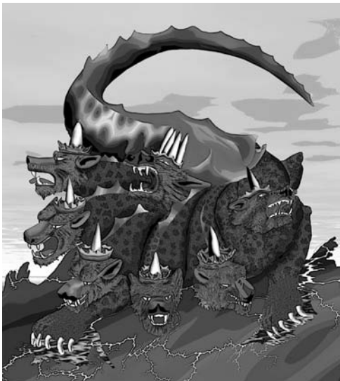
The sea beast of Revelation 13 is a false copy of Christ, the Lamb.

The word antichrist is used in 1 and 2 John only. An antichrist tries to take Christ's place. He is an enemy of Christ. Bible thinkers of different churches have called the sea beast of Revelation 13 an "antichrist" and the man of lawlessness of 2 Thessalonians 2 as well. This is the correct name because the language used in Revelation 13:2–4 shows this sea beast is a false copy of Christ, the Lamb. In 2 Thessalonians 2:4, the antichrist, who is the man of lawlessness, tries to take the place of the Lord.