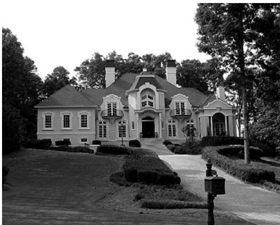
Living in heaven with Jesus is better than the noblest mansion on earth.

“Better than all the friendship of the world is the friendship of Christ’s saved people. Better than a title to the noblest palace on earth is a title to the mansions [homes] our Lord has gone to prepare in heaven. And better than all the words of earthly praise will be the Savior’s words to His faithful servants, ‘Come, ye blessed of my Father, inherit [receive] the kingdom prepared for you from the foundation [beginning] of the world.’ Matthew 25:34.”—Adapted from Ellen G. White, Christ’s Object Lessons , page 374.