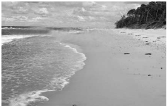
There will be no more sea in the earth made new.

Those of us who love vacationing at the seaside may be disappointed to learn that the sea will be "no more." But, to the people who first heard these words, the sea was a threat. Israel never was a sea-loving nation. For good reasons, the people of Israel feared the dark oceans. And we know from several Gospel 6 stories that even crossing the Sea of Galilee could be a scary experience. John, the writer of Revelation, tells us that in the new world that God will create, all threatening things will have been removed. Everyone who could be a threat to us will be absent. We will be eternally safe!