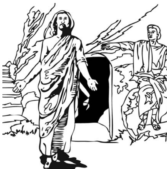
Christ’s own return to life from death helps us to understand what our glorified bodies will be like.

perfect) body that no longer followed the laws of nature in the same way our present bodies do. But at the same time, Jesus had almost the same human body that He had before His death and resurrection. He was the same Person. He was recognized by His appearance, His voice, and His actions. That gives us good reason to think that in our new glorious bodies we will be recognized by those we knew in this life and who will enjoy the life in heaven with us.