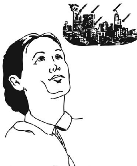
Often Ellen G. White was shown things in vision that would take place far in the future.

Often her visions were given while she was with a group of people. The people saw that certain things hap-