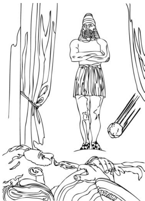
God spoke to Daniel in visions and dreams.

In the Bible we learn that God used dreams and visions to communicate with His messengers. Prophetic dreams played an important role from early times in the work of Bible leaders, such as Abraham (Genesis 20–41).