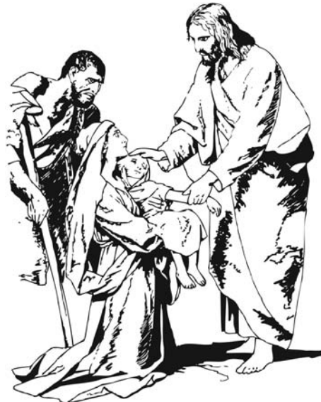
Christ became the place where God joined with the human family to bring us back to Him.

Why? Because after the Fall, Adam and Eve and all of their future children were separated from God. It was a separation that threatened their lives. It was impossible for humans by themselves to be reunited with God. For this reason, the Lord took the first step and reunited Himself with humans. And this He did with the Incarnation, when God became human. Christ became the “place” where the God part joined with the human part in a permanent union. This unity was deeper than the unity between God and humans in the past.